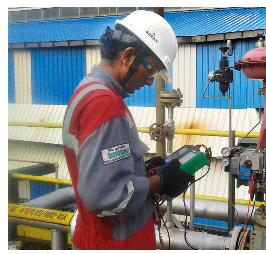
An Engineer at L-Tech Engineering does a field calibration / loop checking.

To attain higher levels of excellence by providing professionalized treatment and specialized technical services, L-tech Engineering is equipped with the