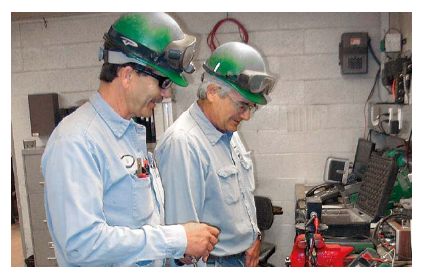
Today it is a much different scene at Monsanto's Soda Springs plant after the incorporation of Beamex's integrated calibration solution (ICS). Calibrations that took days before are now being done in a matter of hours.

The primary purpose for extracting and refining phosphate ore is to make elemental phosphorus which is the fundamental ingredient in Roundup® herbicide. Elemental phosphorous is also used in other industries to make fire retardants, leavening agents, aviation fluids, carbonated beverages and a host of other products. This location continues to develop and add new instrumentation to accommodate the production. About 2 years ago, the plant made significant capital improvements and today, approximately one million tons per year of phosphate ore are mined.